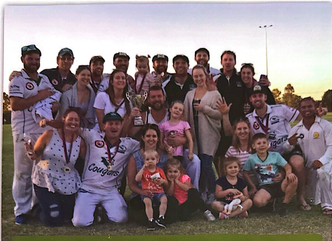
Kella Green Gully C.C. – Luscombe Premiers